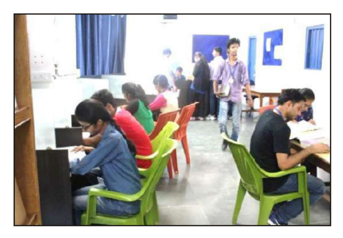
Reading Area in the Central Library