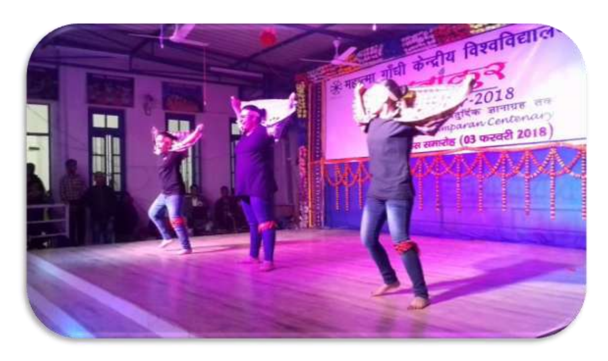
Cultural events on 2^{nd} Foundation day 2 February 2018