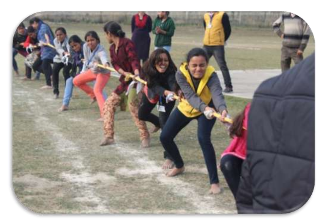
Tug-of-War during the Sports Meet 2017