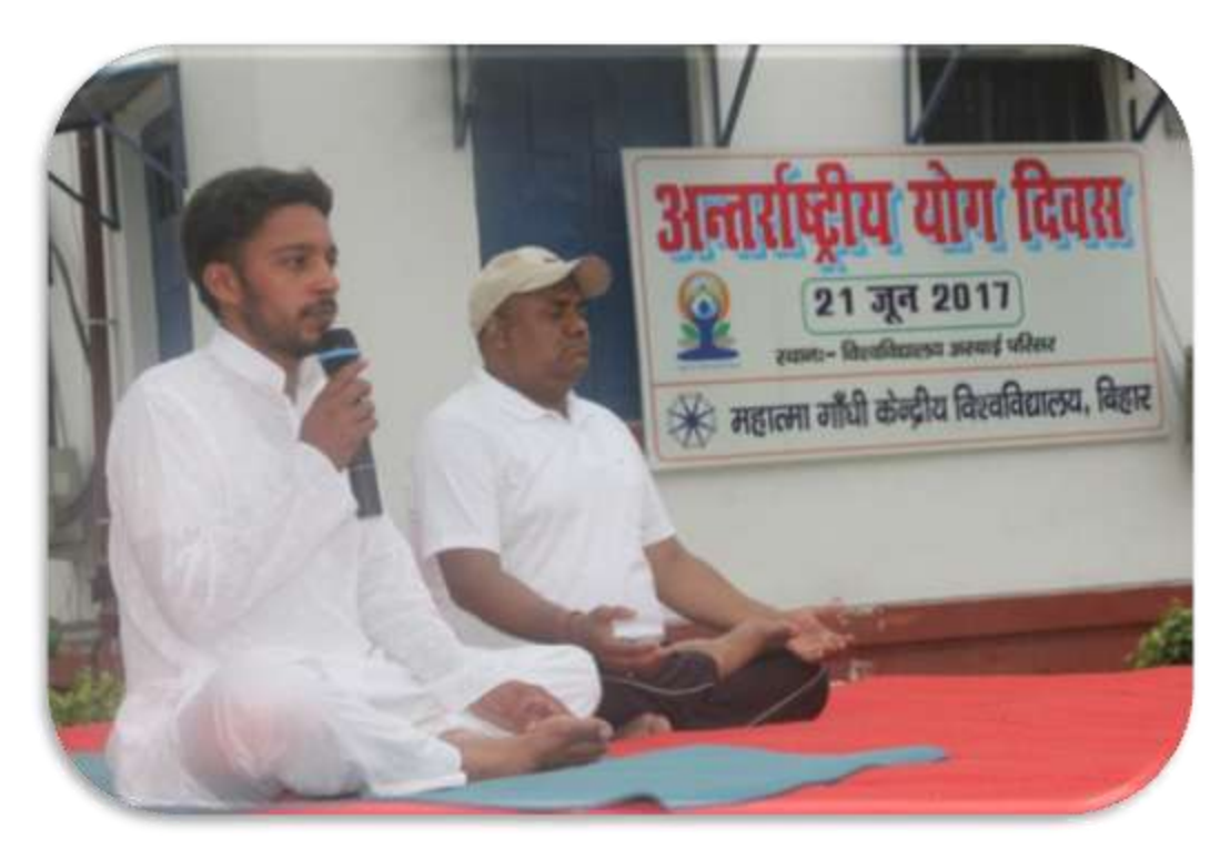
Trainer International Yoga Day