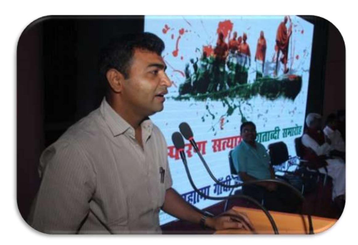
Interaction of IAS officer with students of the university in Film Show on Mahatma Gandhi