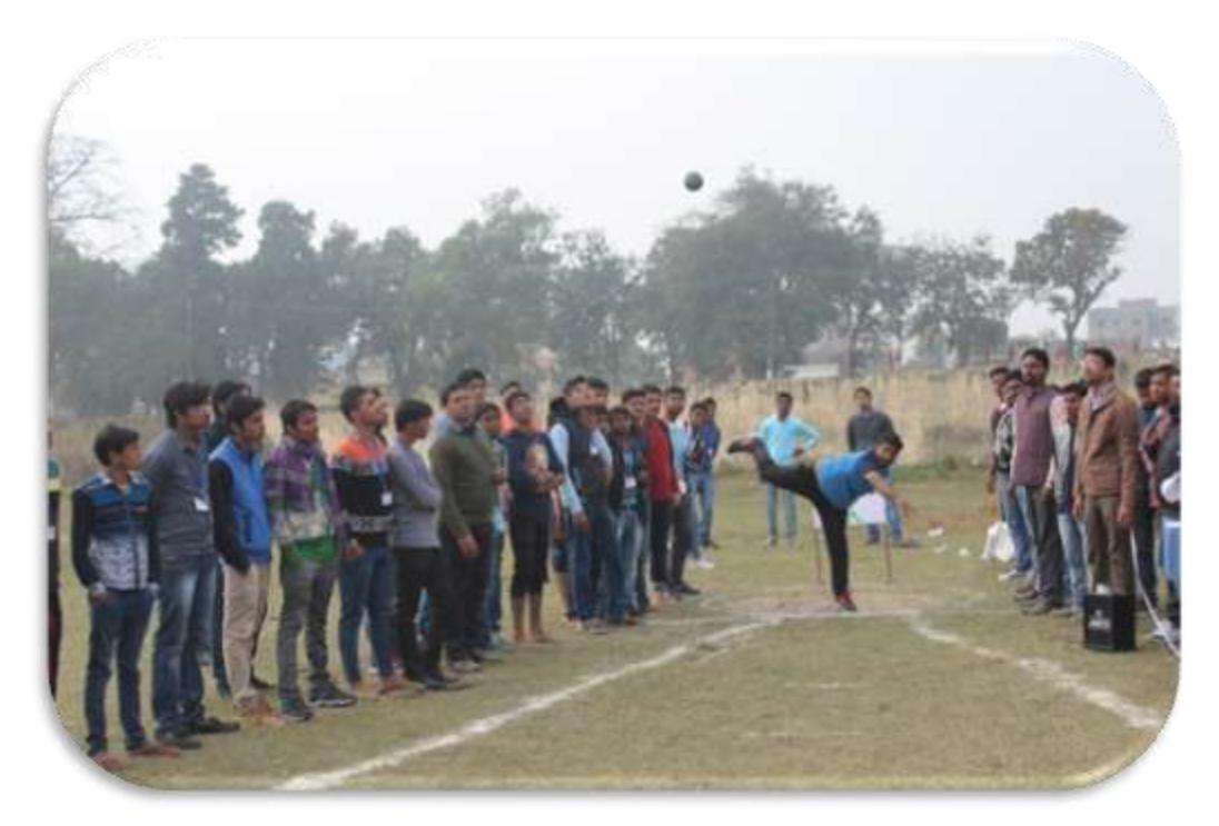
Shot-put event during the Sports Meet 2017